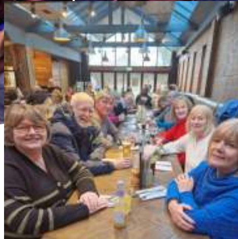
We also visited the German Christmas market at Meadow Croft Garden centre Diane