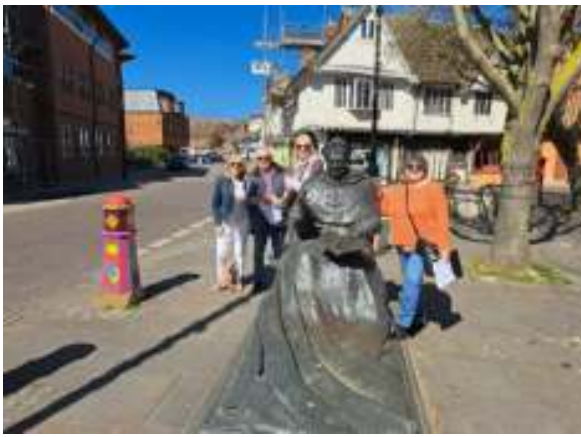
Left: Another picture from the Ipswich Treasure Trial...

We had a very good turnout out (12 in number) for a lovely bluebell walk. Surprisingly a good number of bluebells were on display, so good in fact that a rebel breakaway group decided to extend their walk, arriving late for a lovely meal at the Rettenden Bell pub! Bill